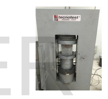
Figure:3 Compressive testing Machine

The results of Compressive strength are plotted in Table.5 and Figure.4